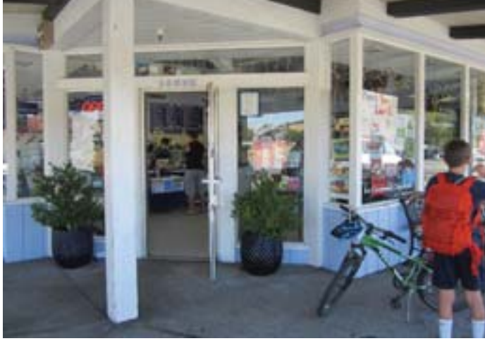
Loard's Ice Cream shop